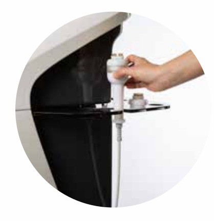
Shaped handpiece shelf